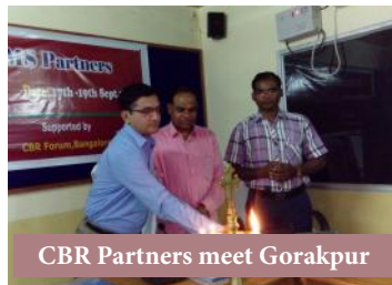
CBR Partners meet Gorakpur