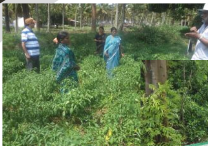
Field visit at Heragu

The Aim of this project is to make a significant impact on women in agricultural sector by upgrading their skills and providing employment. This program is implemented in collaboration with Women and Child development, Agriculture, Horticulture, Krishi Vignana Kendra.