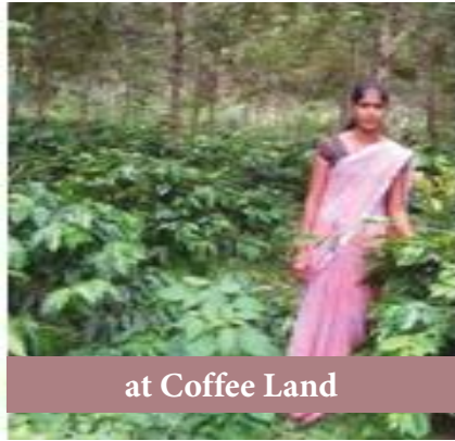
at Coffee Land