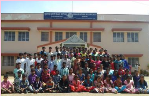
Reporting period 192 economically disadvantaged children across Hassan and Chikmagalur Districts irrespective of cast and creed for the education.

This program is supported by Caritas Prague, Czech Republic - Europe. The main objective of this project is financial assistance for the education of the poor children.