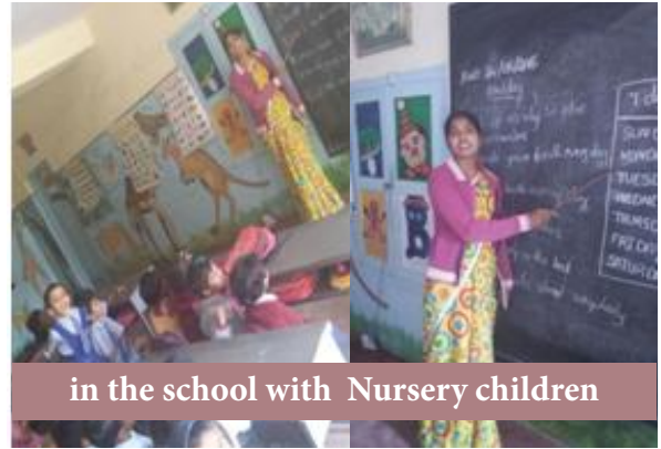
in the school with Nursery children